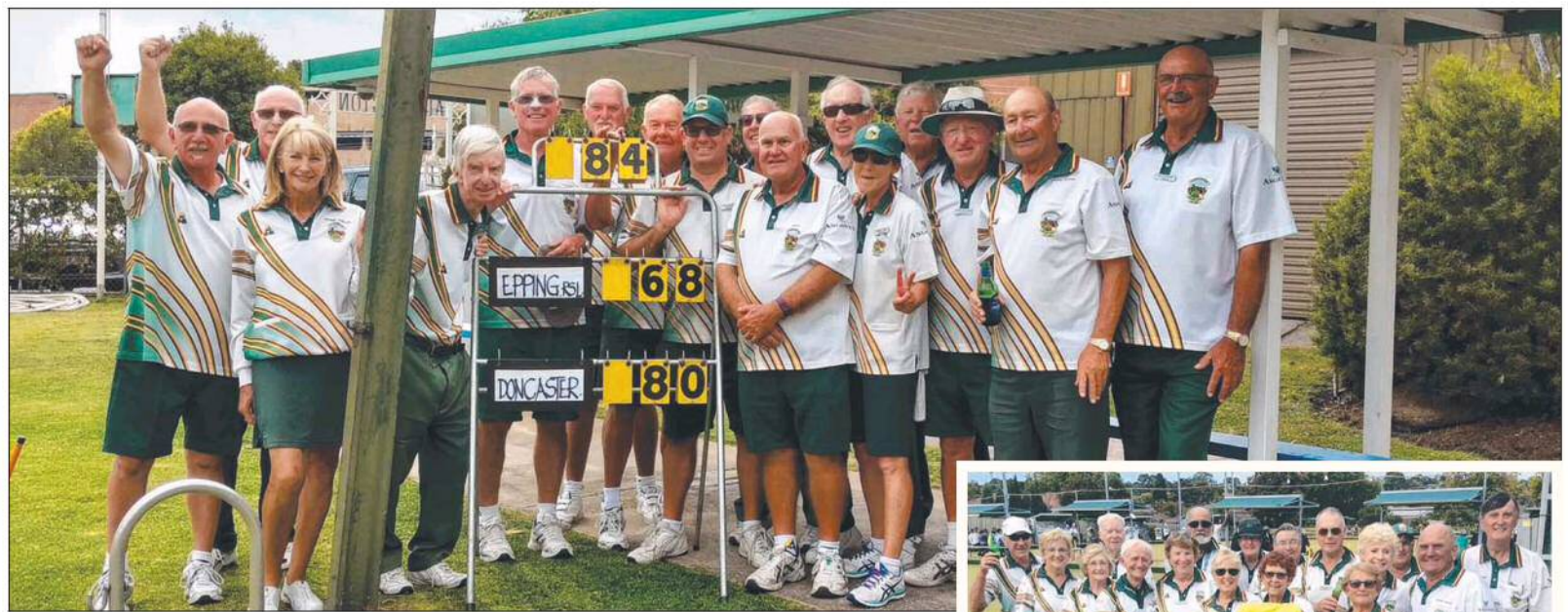
Doncaster's No.1 side gathers around the scoreboard after defeating Epping RSL at Alphington and (right) the No.4 side also celebrates its big win against Whittlesea at Rosanna.

Dream comes true for Doncaster Bowling Club with two sectional pennant flags in one weekend